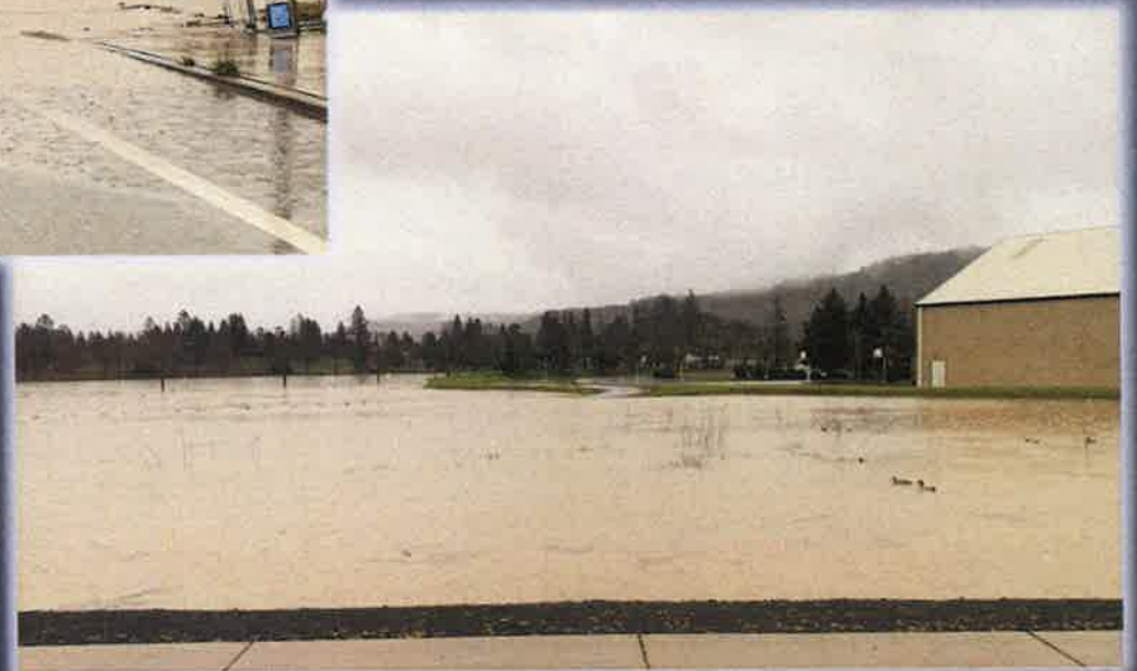
UMPQUA VALLEY TENNIS CENTER