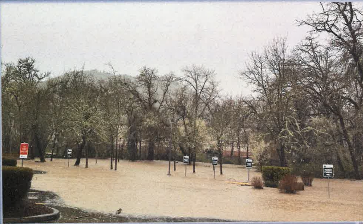
EDENBOWER BOULEVARD / EVERGREEN MEDICAL