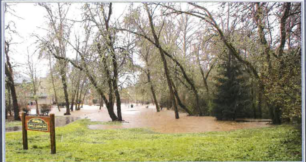
CHARLES GARDNER PARK