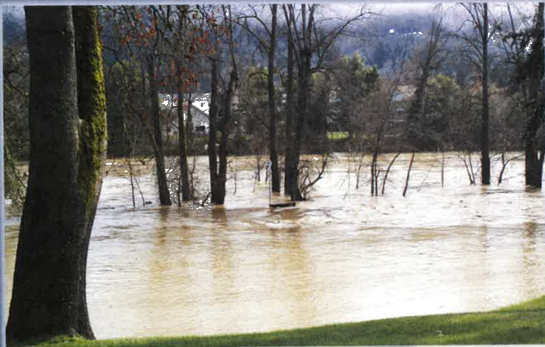
HALF SHELL / STEWART PARK