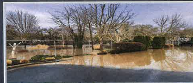
DEER CREEK/PUBLIC SAFETY CENTER PARKING LOT