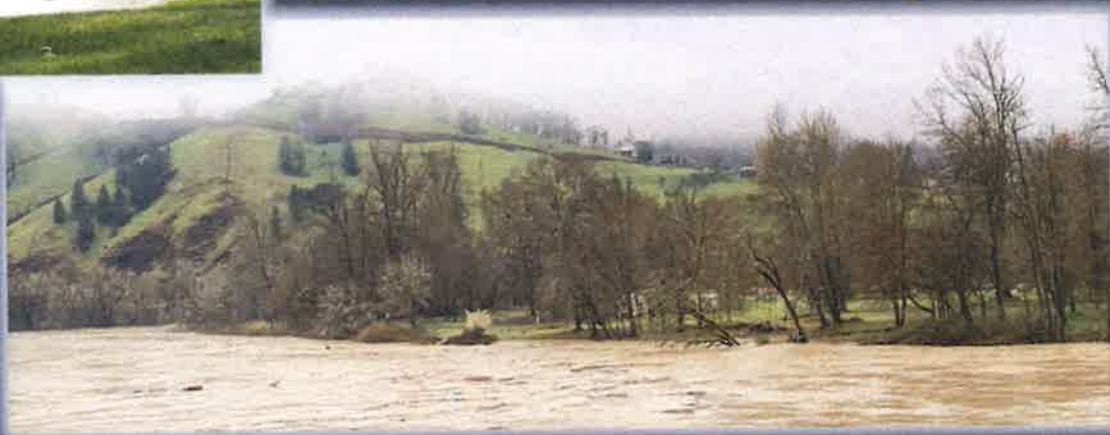
SOUTH UMPQUA RIVER / ELK ISLAND