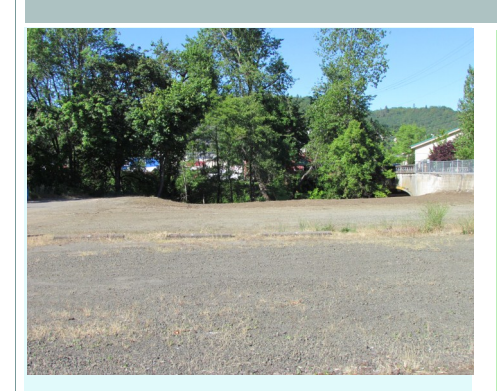
Jackson Street property today after demolition and clean-up