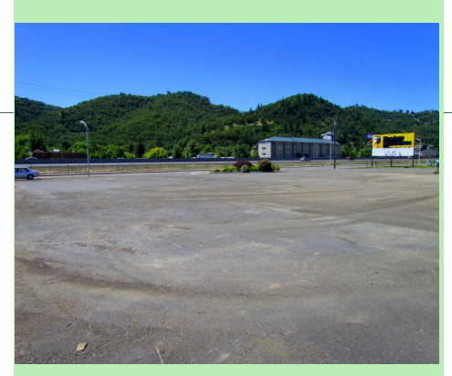
Lot facing west towards I-5 and billboard