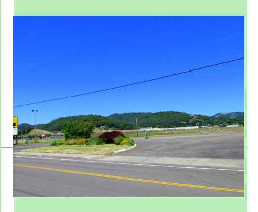
Lot entrance from Aviation Drive