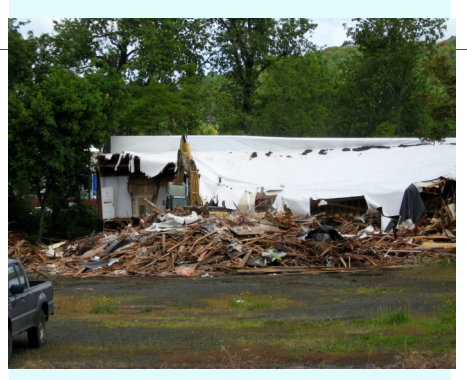
Demolition - May 31, 2011