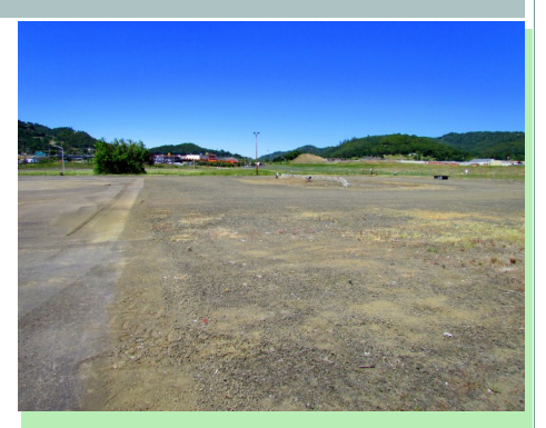
Back portion of lot facing north