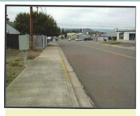
Street scene, facing east on Ward Street, the subject property is located on the left