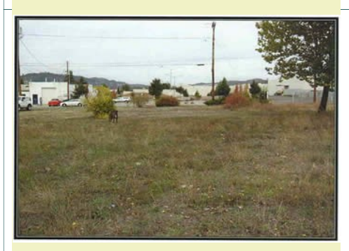
Northerly view of the subject property