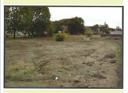
Southerly view of the subject property from Ward Street

In 2003 the City's Urban Renewal Agency purchased properties multiple accommodate parking for Dell. With Dell's departure, those properties have now been determined to be surplus to the City's needs. Therefore, the City is offering for sale property located at 1112 and 1152 NE Post Street. This 0.78 acre (33,977 square feet) parcel is zoned for multiple use and is ready to build. All utilities are Asking price on property. of $195.000. If anyone is interested in this property, should contact City Recorder Sheila Cox at 541-492-6866 or scox@cityofroseburg.org.