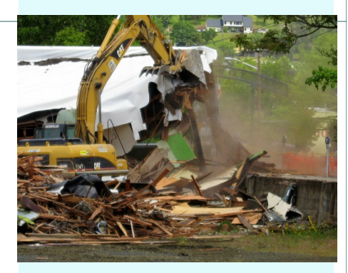
Demolition began May 31, 2011