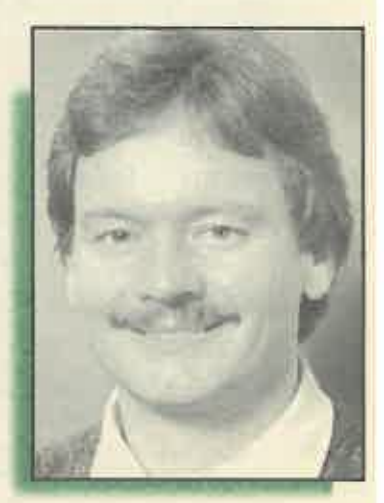
Larry Rich Mayor

funding, the number of people using the parks increased nearly 21% over last year. The Department was forced to reduce maintenance in some of the smaller, lesser-used parks in order to preserve acceptable maintenance in more popular recreational areas such as Stewart, Gaddis, Riverside and Sunshine Parks. This year, 373 permits were issued for park reservations which accommodated over 46,000 visitors. The department also provided fields and facilities for organized sporting events whose 4,750 players were double the number involved in 1996. Prefabricated restrooms, manufactured locally,