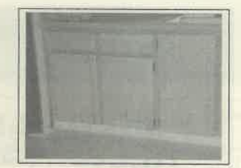
Home in the Mill-Pine Neighborhood before and after housing rehab work.